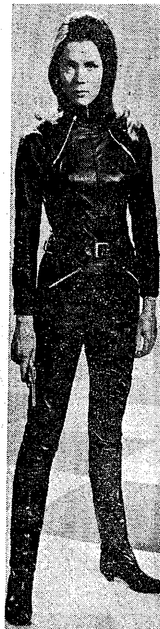
Diana Rigg: awesome

"Since then I've had no worries. I just impersonate Benny Hill."