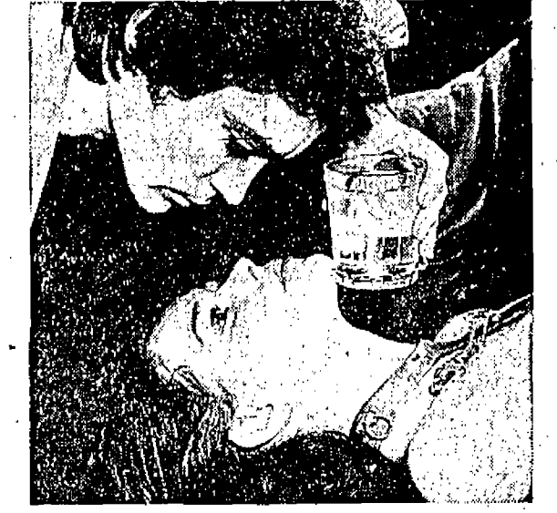
Corinne Clery and Udo Kier in a scene from Just Jaeckin's new film "The Story of O"

THE inventor of Porno Chic (he would prefer Erotic Chic, but no one will listen) said sardonically: "Oh, yes, I am what you call a 'ot property. Every door is open to me."