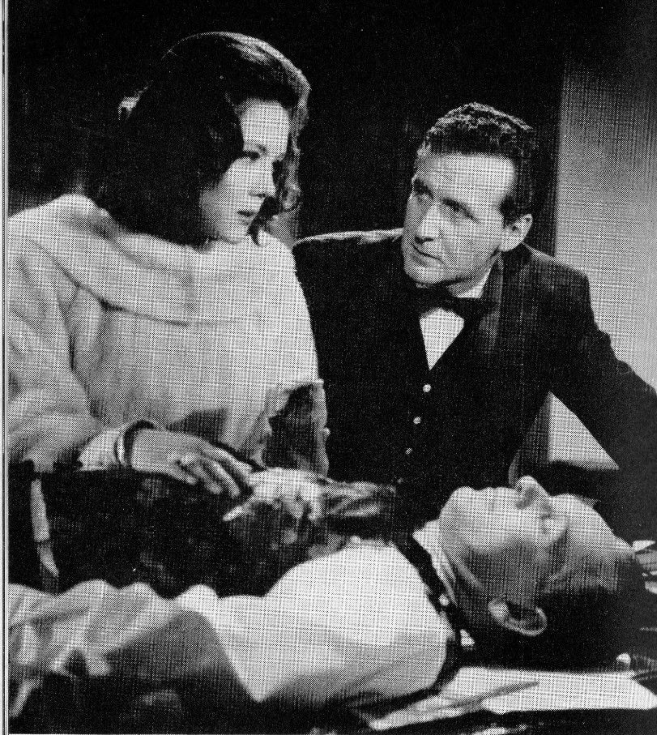
Patrick Macnee and Diana Rigg in "The Avengers"